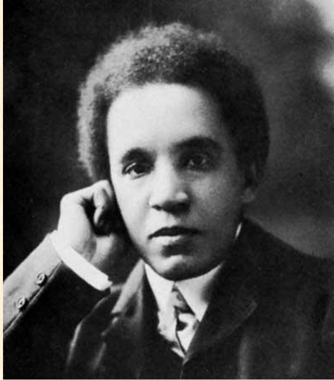
Samuel Coleridge-Taylor 1875-1912